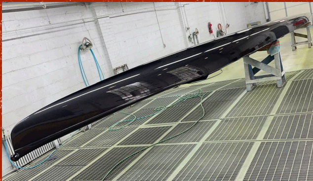
First Class Repair